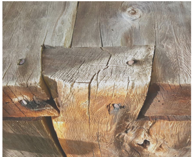
Hewed timber planks used in Lindgren Cabin.

The Lindgren Cabin was ax hewn out of old growth Oregon Red Cedar logs. Some of those trees were nine feet in diameter. The cabin was 40-feet long and 24-feet wide. Erik and William Merilä hewed those timbers into planks 4-1/2 inches thick and 42 inches wide. The logs were so squarely hewn that Erik did not need to do any chinking. The five-room cabin was put together with scarcely a nail. Erik fishtailed the corner planks, cut each outside wall plank at a cant to keep out the rain, erected 42-foot eave timbers gouged out for rain runoff, and used wooden dowels to hold together the long and wide wall planks.